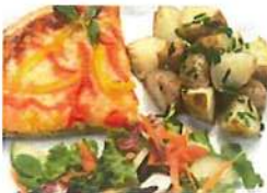
Margherita pizza & jacket wedges