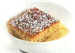
Coconut sponge & custard