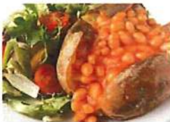
Jacket potatoes with cheese, beans or tuna & mixed salad