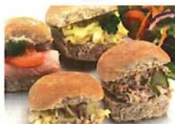
Filled roll with cheese, ham, egg or tuna & mixed salad