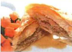
Vegetarian sausage roll, gravy & roast potatoes