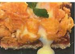
Cornflake tart & custard