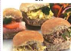
Filled roll with cheese, ham, egg or tuna & mixed salad