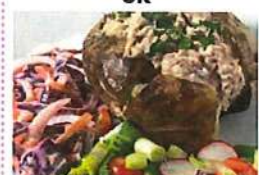
Jacket potatoes with cheese, beans or tuna & mixed salad