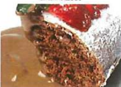
Magic chocolate pudding & chocolate sauce