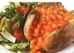
Jacket potatoes with cheese, beans or tuna & mixed salad