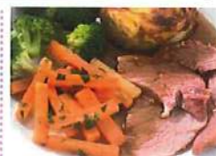
Roast gammon, Yorkshire pudding, gravy, mashed & roast potatoes