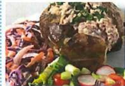
Jacket potatoes with cheese, beans or tuna & mixed salad