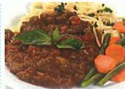
Spaghetti bolognese & garlic slice