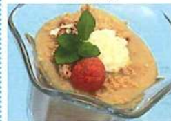
Butterscotch mousse & shortbread finger