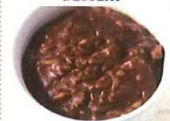
Chocolate rice pudding