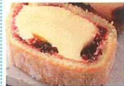
Raspberry ripple ice cream roll