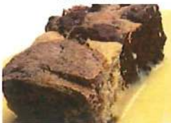
Marble sponge & custard