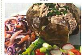
Jacket potatoes with cheese, beans or tuna & mixed salad