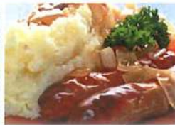
Nottinghamshire sausage, Yorkshire pudding, gravy & mashed potatoes