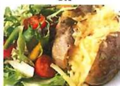
Jacket potatoes with cheese, beans or tuna & mixed salad