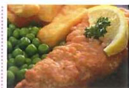
MSC Breaded fish & chips