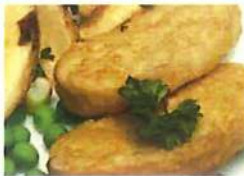
Quorn dippers & savoury rice