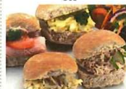
Filled roll with cheese, ham, egg or tuna & mixed salad