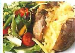
Jacket potatoes with cheese, beans or tuna mixed salad