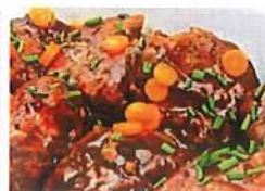
Porkies in gravy, Yorkshire pudding & mashed potatoes