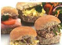
Filled roll with cheese, ham, egg or tuna & mixed salad