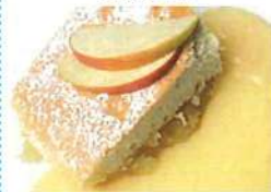
Spiced apple cake & custard