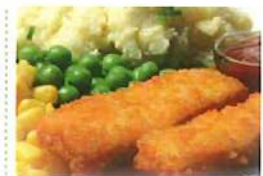
MSC Fish fingers & diced potatoes