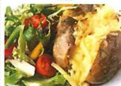
Jacket potatoes with cheese, beans or tuna & mixed salad