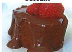
Chocolate ice cream roll & chocolate sauce