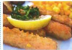
Fish goujons & potato wedges