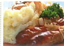
Nottinghamshire sausage, Yorkshire pudding, gravy & mashed potatoes