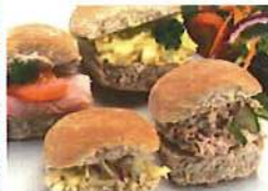
Filled roll with cheese, ham, egg or tuna & mixed salad