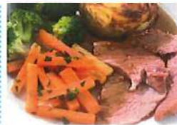
Roast gammon, Yorkshire pudding, gravy, mashed & roast potatoes