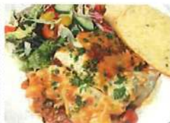
Beef lasagne & garlic slice