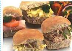
Filled roll with cheese, ham, egg or tuna & mixed salad