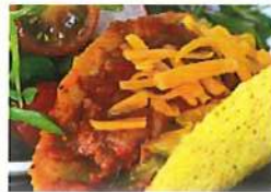
Beef Tacos & potato wedges