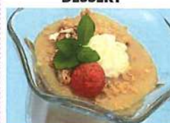
Butterscotch mousse & shortbread finger