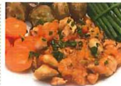
Chicken casserole, mashed potatoes & Yorkshire pudding