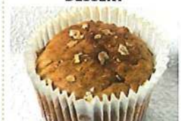
Oatmeal & yoghurt muffin